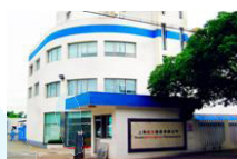
Shanghai J&J Pharmaceuticals