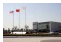
J&J Medical Suzhou