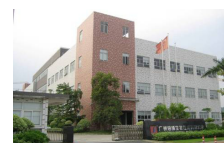
Guangzhou Bioseal Biotech

“The work we’re doing in China illustrates how we’re building our businesses in important emerging markets.”