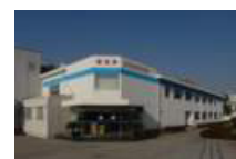
J&J Medical Shanghai