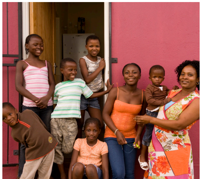
At SOS Children's Villages children are raised in a loving family, sheltered in a safe home, and receive quality education and health care

For more than 20 years, Johnson & Johnson has supported efforts by SOS Children's Villages to create a brighter future for thousands of vulnerable children and families around the world. In Africa, the company supports programs to prepare orphaned and abandoned children living in SOS villages to become self-sufficient and productive adults, as well as family strengthening programs that promote economic self-sufficiency, improved psychosocial health, and parenting skills. Currently, J&J supports SOS programs in Ghana, Kenya, Liberia, Mozambique, Nigeria, Sierra Leone, South Africa and Somalia that benefit approximately 11,000 children and families.