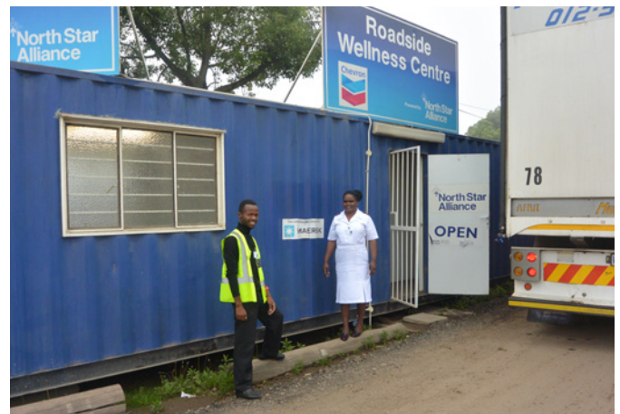
Wellness Centers are strategically situated at major truck stops and border crossings in Africa and housed in easily recognizable blue shipping containers

North Star Alliance offers primary health care services, HIV testing and health education to hard-to-reach, mobile populations such as truck drivers and sex workers, through their Blue Box Roadside Wellness Centers. Each drop-in center is run by trained clinical and outreach teams and supported by an electronic health passport system, which allows clients to access their health records at any center in the network, as well as keeping track of the spread of disease. Johnson & Johnson has partnered with North Star Alliance to scale and improve North Star's model of Blue Box walk-in clinics in Kenya, South Africa and The Gambia.