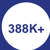
Courses of MDR-TB medication delivered

Our progress on scaling up access to our MDR-TB medicine: