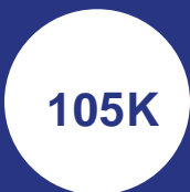
Free courses through 4-year donation program