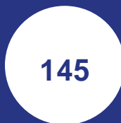
Countries accessing our medicine, including the 30 highest-burden countries