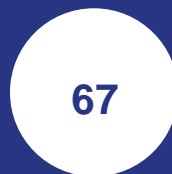
Countries in which our new medicine has been approved